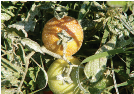
Figure 3. A cluster of Surround WP-treated tomatoes after the 3rd spray application on July 23. The plots were sprayed using a 3-nozzle boom, with the nozzles arranged to apply a full-coverage spray over the tomato plants.