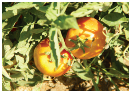
Figure 6. "Residue" free Success-treated tomatoes after the third spray application on July 23.