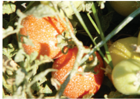
Figure 4. Eclipse-treated tomatoes after the third spray application on July 23.