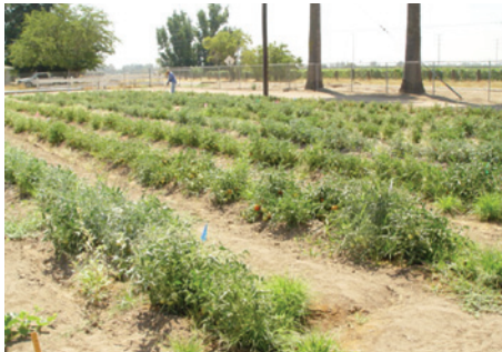
Figure 1. Test site consisting of Hybrid Sun 6117 processing tomatoes planted in 200 foot rows. A Surround WP plot is in the foreground, marked by a blue flag, showing the characteristic white residue of the product.

The test was placed in an established planting of processing tomatoes that were already at early fruit set at study initiation. A total of three applications were made over a two-week period, which left most plants covered in speckles of accumulated residue. The exception to obvious signs of product residue on plants was the Success plots, which appeared to be residue-free (Figures 1-6).