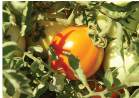
Figure 2. A cluster of tomatoes from the untreated group on July 23, the day of the third application of test materials to the treated plots.