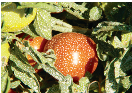
Figure 5. Cocoon-treated tomatoes after the third spray application on July 23.